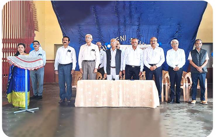
Cheque disbursement to beneficiaries - 17th August, 2025