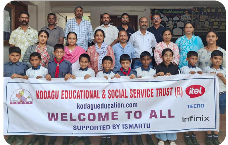
Candidates for Sainik School Entrance Exam, 18 th Jan 2026, along with parents, teachers, and trustees

We continued our efforts of offering coaching for the Class 6 Entrance Exam at Lions School, Gonikoppal, whose management has been very supportive in this initiative.