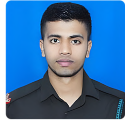
Candidates who were successful in joining various military academies and received their commissions