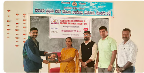
Top Left: Triveni School, Virajpet. Top Right: Lions Primary School, Gonikoppa. Bottom: Govt Women's College, Madikeri

As part of our outreach to provide certain infrastructure to educational institutes, KESST provided CCTV coverage (complete kit), including installation, to Triveni School, Virajpet, at a cost of Rs 1,00,400.