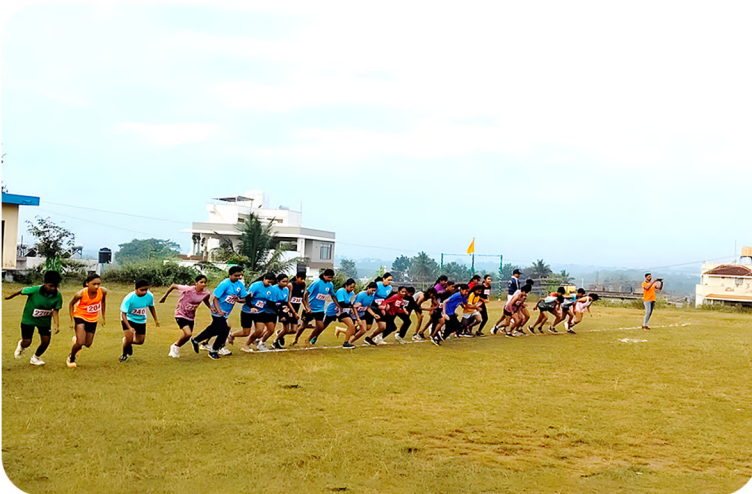
4th State-level Cross Country (Ponnachanda Neeraj Kushalappa Memorial Race) Race for Youth Eligible for Joining Defence Forces, 1st December 2024 at Kushalnagar (Kodagu)