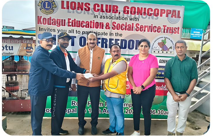
National Spirit and Patriotism - Spirit of Freedom Marathon