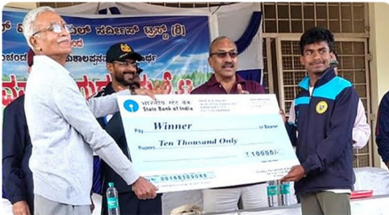
4th State-level Cross Country (Ponnachanda Neeraj Kushalappa Memorial Race): Boys' Winners