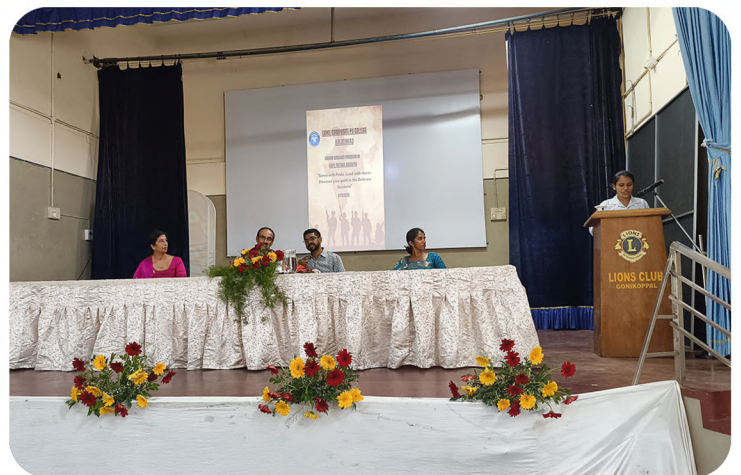
Career Awareness Program at Lions School, Gonikoppa