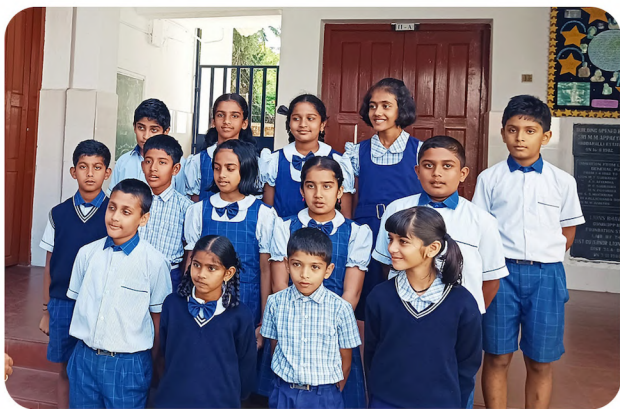
Aspirants for the Sainik School Entrance Exam Jan 2024

In the financial year 2023-24 KESST has incurred an expenditure of Rs 26,18,935/- to support 126 children, of which 64 are girls, 10 are abandoned by family or orphans being cared for by grandparents or other relatives, 56 have mothers as a single parent. School notebooks worth Rs 30,263.72 were given to needy children. In addition, two girls, one for Civil Services coaching and one girl in B. Sc Nursing was given financial support of Rs 1,03,800/-.